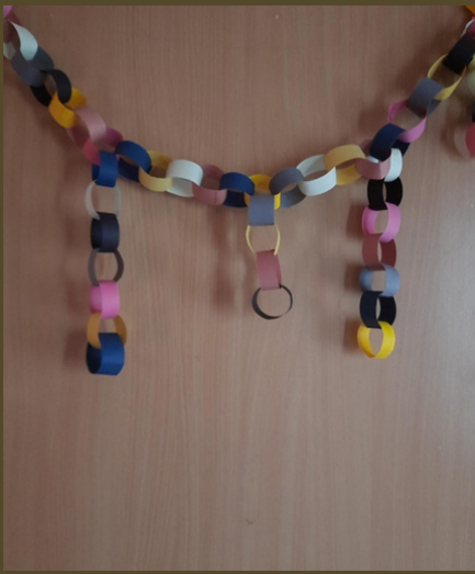
Craft with Paper Rolls