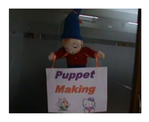
Puppet making activity