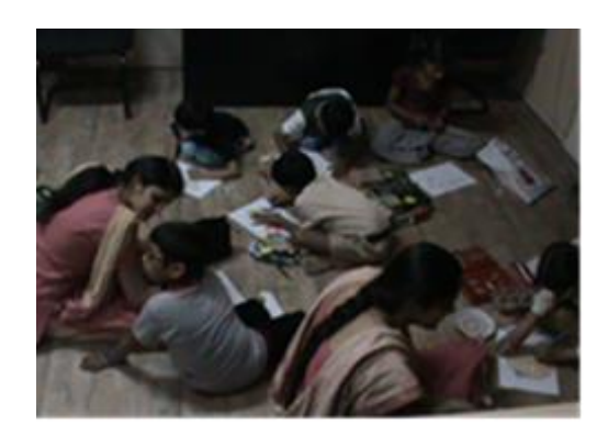
Students engrossed in puppet making