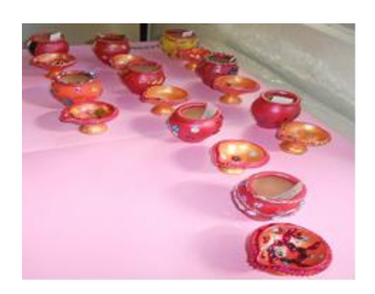
Students engrossed in Pot Decoration activity at resource centre