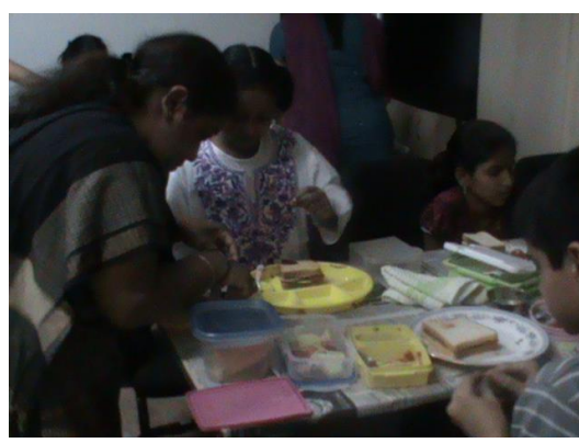
Learners are TTP